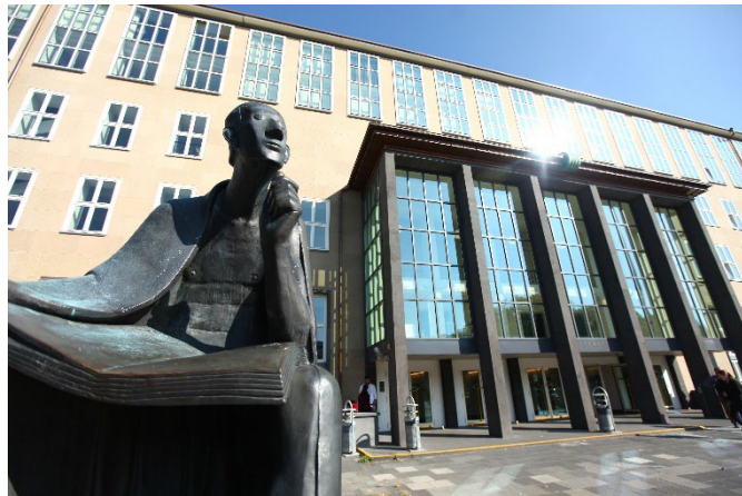
Main building of the University of Cologne, Albertus Magnus Platz

University of Cologne Albertus Magnus Platz 50923 Cologne